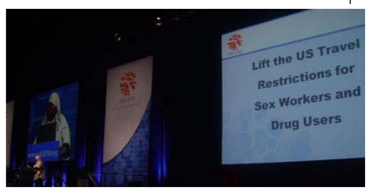
The North American activist Waheedah El-Shabazz projected a slide demanding the lift of the travel restrictions to the USA for sex workers and drug users.