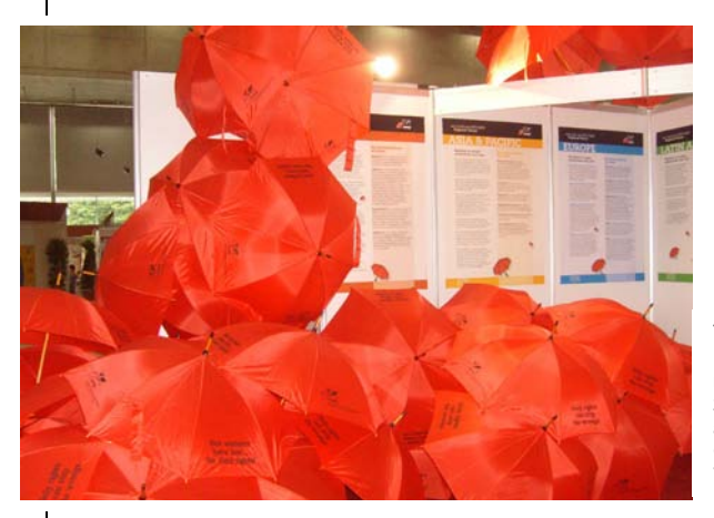
The NSWP networking zone at the Global Village

The conference consisted of different types of activities: sessions, debates, workshops, film screenings, performances, protests and human rights rallies. Most of the activities took place inside the main conference venue, in the Global Village and in the NSWP networking zone.