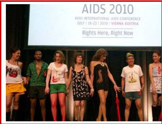
Models at the end of the DASPU show