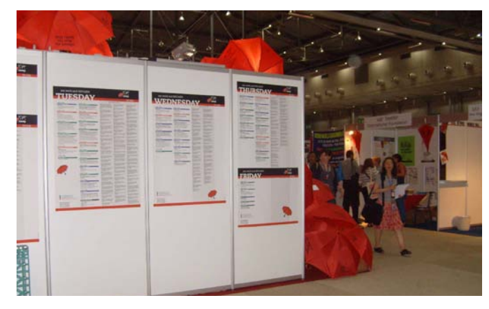
The NSWP networking zone's outside wall with the exhibition of the roadmap

The Global Village gave me the possibility to speak at the Women's Networking Space, where I could share my experience on behalf of Asian sex workers and inform about the Malaysian law on the "shariah". This conference made me confident to speak out as a sex worker.