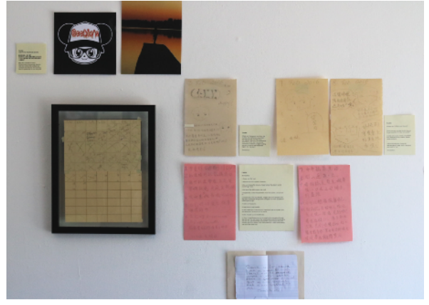
Exhibition in Whippersnapper Gallery: Butterfly Voices, 2016

"In January 2016, I received a departure order from the Canada Border Services Agency [CBSA]. The officer inquired as to whether or not I had been seen by a psychiatrist or a social worker within the last two months. He then proceeded to ask if I had taken any psychiatric mediation. I told him no. Despite this, the officer thought that I was attempting to escape the investigative process, so he decided to arrest me to await deportation in the future.