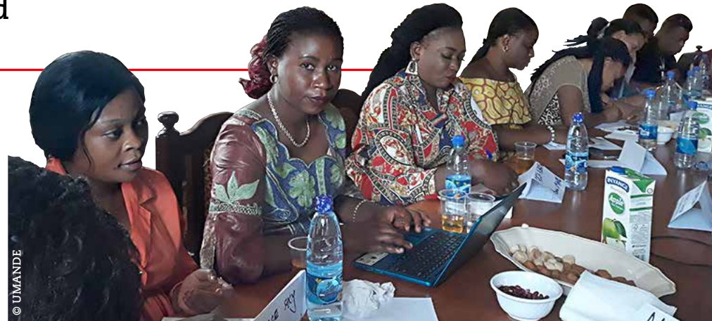
UMANDE's roundtable with DRC national stakeholders about sex workers' meaningful involvement in Global Fund national processes (October 2019)

NSWP knowledge-sharing, technical support and training has been a catalyst for longer-term change. In Suriname,